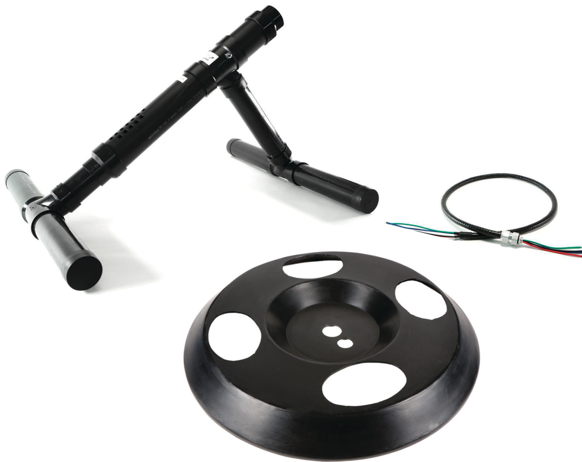
Submersible Pump Stand

Winterizing a water supply pipe from a lake, river, and or other water body is one of the most rewarding investments a homeowner can make in their property. Heat-Line makes this investment possible by developing and manufacturing the most advanced heating cable systems available, and offers submersible pump wire, submersible pump stands and foot valve stands to compliment your water supply system.