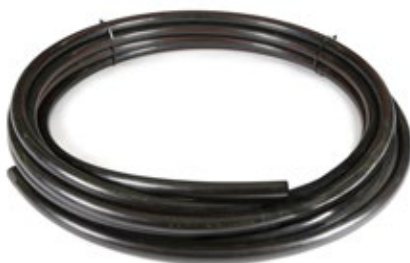
75 PSI Certified Polyethylene Pipe